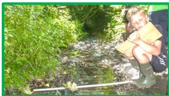
Recording data carefully near the source of the Glaven.

Year 6 at the Prep School spent Monday morning visiting the River Glaven, tracking its course from source to mouth. At the various destinations, they measured the width of the river, looked at the difference in depth across their transect and took readings of the flow rate too. On such a glorious day, the children thoroughly enjoyed getting into the river and putting their classroom learning into practice.