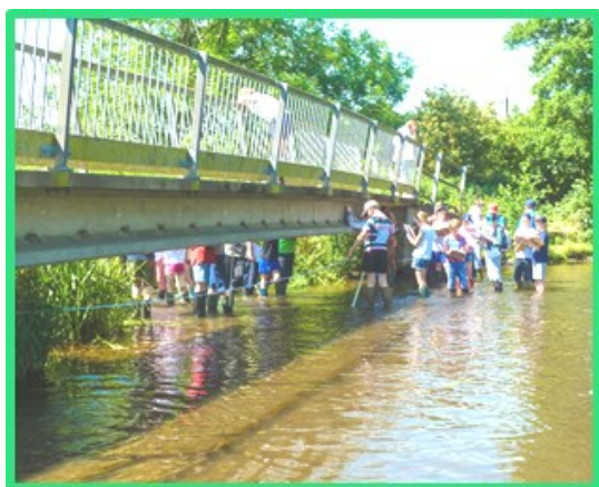
Everyone gets into the river to cool down and take a final set of results.