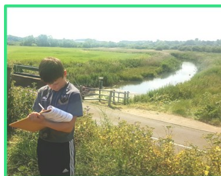
Time for one last field sketch near the mouth of the river at Cley.