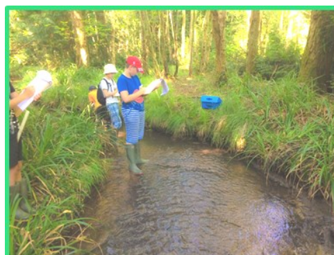
Making a field sketch of the upper course of the Glaven near Selbrigg Pond.