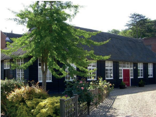
ESL & Learning Support