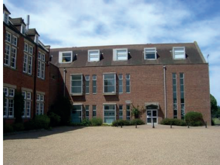
The Reith Block

Physics Chemistry Chemistry Lecture Theatre Computer Science