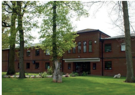
The Cairns Centre