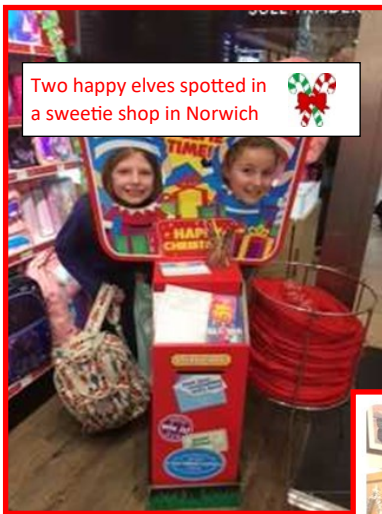
Two happy elves spotted in a sweetie shop in Norwich