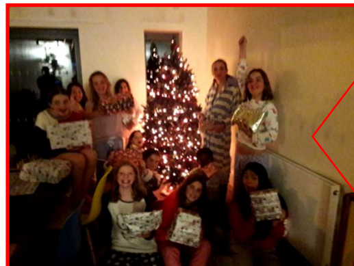
All presents wrapped and under the tree