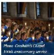
Photo: Gresham's Chapel 100th anniversary service