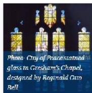
Photo: City of Peace stained glass in Gresham's Chapel, designed by Reginald Otto Bell

EMAIL TO A FRIEND TWEET THIS STORY SHARE ON FACEBOOK