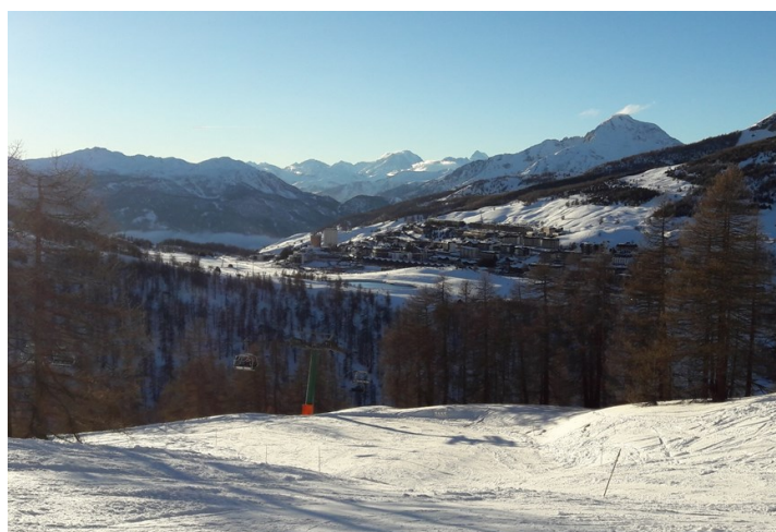
View of Sestriere – Milky Way Ski region 440km

Ski School meeting point. (09.00 – 12.00 & 2.45 – 4.45pm every day)