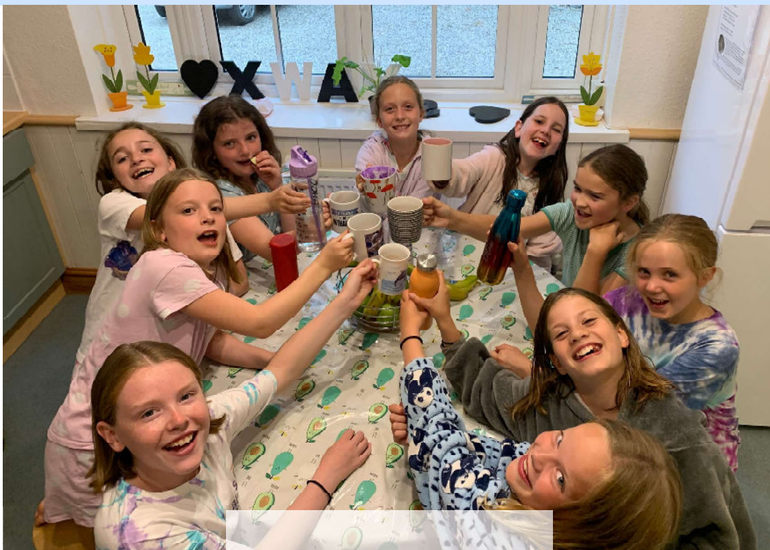
Some of the girls enjoying a hot chocolate in the evening.