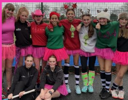
Boarding and day students take pride in representing Oakeley in school competitions and events.

You may bring with you laptops, desk lamps, mobile phones, hair dryers, hair straighteners and chargers. Please leave hair straighteners on heat mats and remember to turn off all electrical equipment when not in use. We only allow battery-operated fairy lights in rooms.