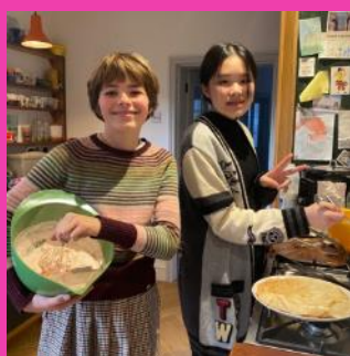
Baking for our charity cake sale.