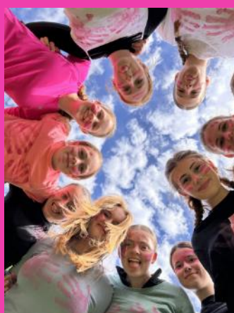
The annual Gritty Grasshopper event puts the House laundry to the test...

Any medication left lying around will be removed. Your medication must be recognised in the UK. Never give anyone else ANY medicines (not even painkillers e.g. Paracetamol, Nurofen etc.)