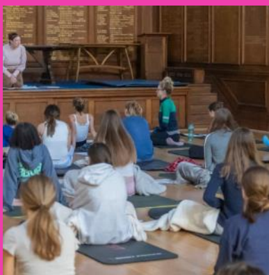
House social events are held throughout the year, including Wellbeing events.

You do not need large sums of money! Keep any cash locked away or sign up for a bank account in town. Let a member of staff know if you need help with this. House staff can look after small amounts of pocket money and passports.