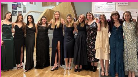
All ready for the Year 11 formal.

Students may also visit other Boarding Houses or go into Holt across the weekend.