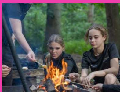
Oakeley girls learning new skills at the school's Woodland Adventure Centre.

Regulation games kit should be worn. Oakeley girls love participating in inter-house events and enjoy the camaraderie that comes from them.