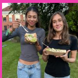
Sharing an evening meal with friends in the House.