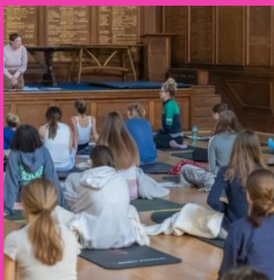
House social events are held throughout the year, including Wellbeing events.

You do not need large sums of money! Keep any cash locked away or sign up for a bank account in town. Let a member of staff know if you need help with this. House staff can look after small amounts of pocket money and passports.