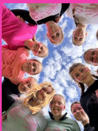
The annual Gritty Grasshopper event puts the House laundry to the test...

Any medication left lying around will be removed. Your medication must be recognised in the UK. Never give anyone else ANY medicines (not even painkillers e.g. Paracetamol, Nurofen etc.)