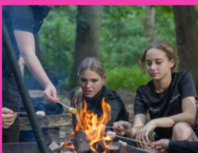
Oakeley girls learning new skills at the school's Woodland Adventure Centre.

Regulation games kit should be worn. Oakeley girls love participating in inter-house events and enjoy the camaraderie that comes from them.