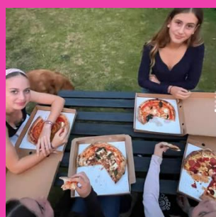
Sharing an evening meal with friends in the House.