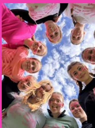
The annual Gritty Grasshopper event puts the House laundry to the test...

Any medication left lying around will be removed. Your medication must be recognised in the UK. Never give anyone else ANY medicines (not even painkillers e.g. Paracetamol, Nurofen etc.)