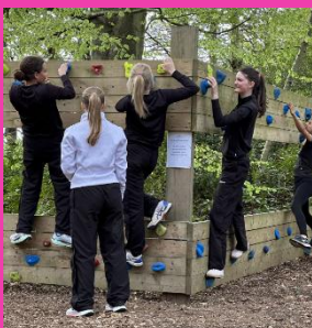
Oakeley sixth formers lead and take part in all kinds of House activities

Our House and School Prefects supervise prep, take roll-calls and help with bedtimes. They are keen to support you in all aspects of your school life. You will also be buddied with a girl in the year above who will help you to settle into the House and Gresham's as a whole.