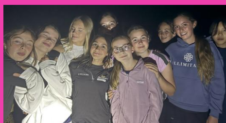
Evening house activity in the Woods