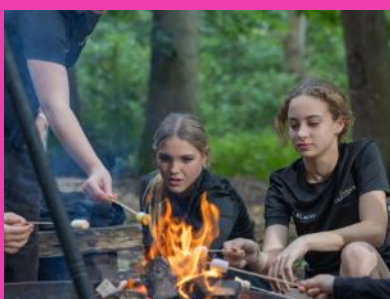
Oakeley girls learning new skills at the school's Woodland Adventure Centre.

Regulation games kit should be worn. Oakeley girls love participating in inter-house events and enjoy the camaraderie that comes from them.