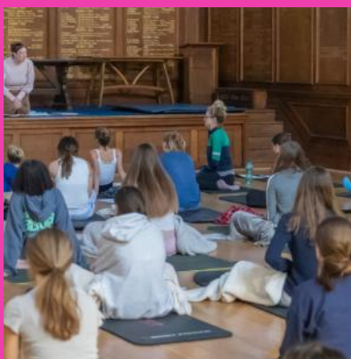
House social events are held throughout the year, including Wellbeing events.

You do not need large sums of money! Keep any cash locked away or sign up for a bank account in town. Let a member of staff know if you need help with this. House staff can look after small amounts of pocket money and passports.