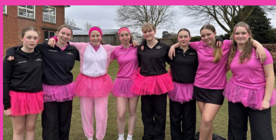
Boarding and day students take pride in representing Oakeley in school competitions and events.

You may bring with you laptops, desk lamps, mobile phones, hair dryers, hair straighteners and chargers. Please leave hair straighteners on heat mats and remember to turn off all electrical equipment when not in use. We only allow battery-operated fairy lights in rooms.