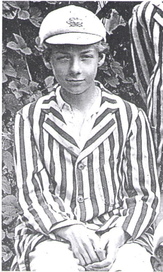
■ Benjamin Britten during his schooldays and above left, a photo of the composer by Hans Wild. Picture: SUBMITTED/HANS WILD/BRITTEN-PEARS FOUNDATION

a remarkable personality he had – good or bad."