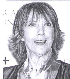
Actors with roles in the new film are, from top, John Hurt, Christian McKay, Dame Eileen Atkins, and left, Caroline Catz.