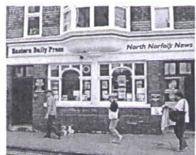
The Cromer office of the Eastern Daily Press and the North Norfolk News where filming has been taking place.

The lead male role of David, the editor of the local paper, is played by Christian McKay who was Lord Hesketh in the motor racing film Rush.