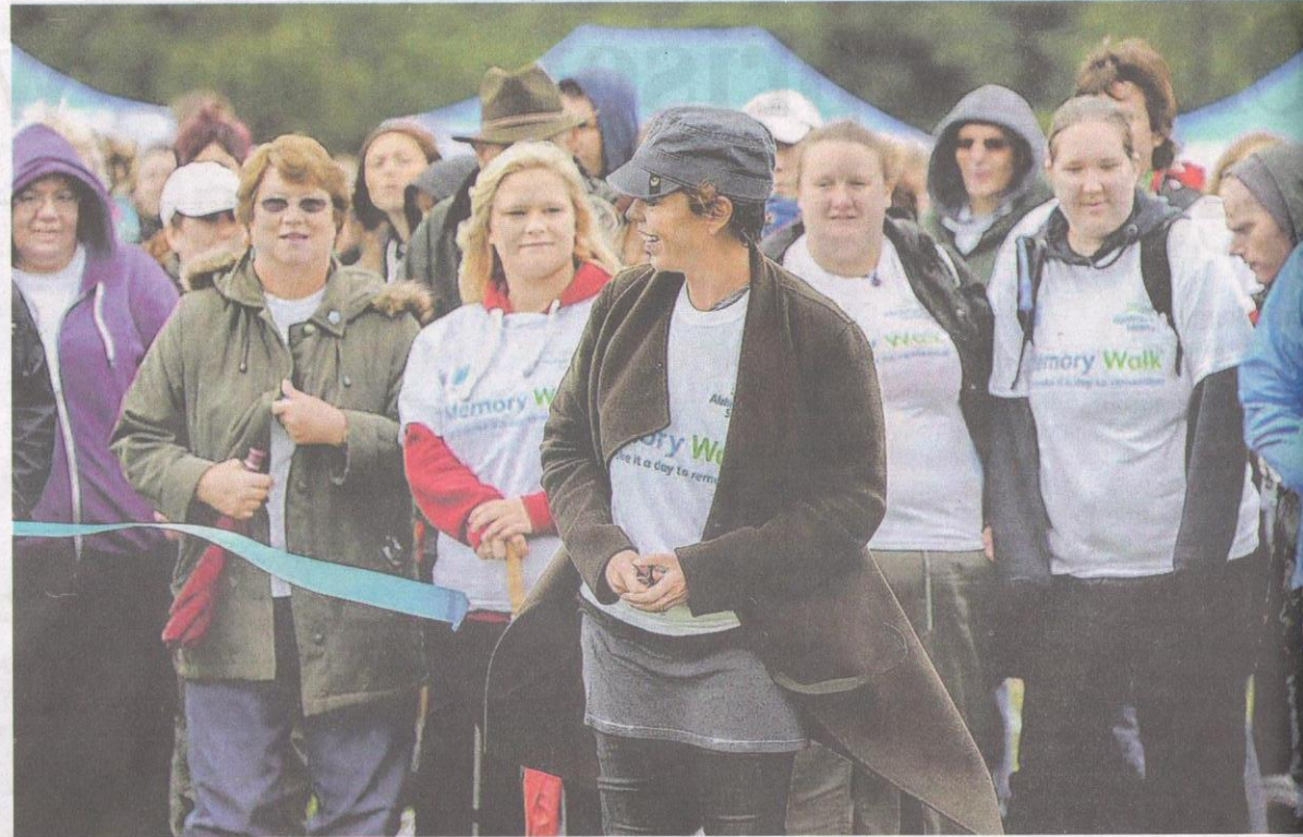
■ Olivia Colman starts the Memory Walk at Holkham Hall yesterday before completing the event with her parents. Left, a message to a loved one.

"Her grandmother died after suffering from dementia and she had a nursing home where she looked after a lot of people with dementia.